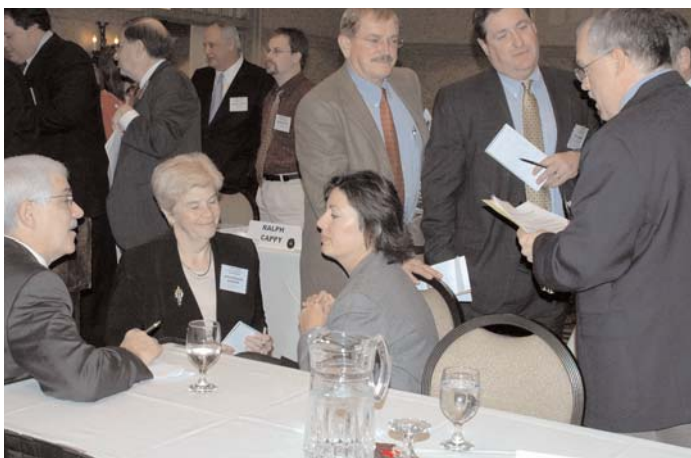
Journalists and judges switched roles in an exercise to help them better understand each other's jobs.